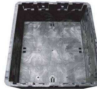
ROPAK 3A containers feature a Closed Deck, shown above.

Additionally, two bases are available: A two-way forklift entry, conveyable model, and a four-way forklift entry model that is not conveyable. Please call Customer Service at 1.800.614.9598 for more information.