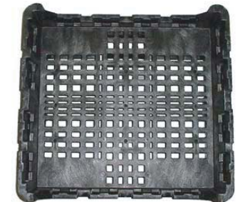
ROPAK 3B containers feature an Open Deck, shown above.