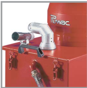
Large top inlet allows chips and other debris to be picked up and separated.