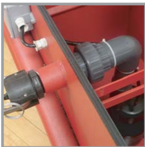
Return pump allows liquid return at 38 gallons/minute.