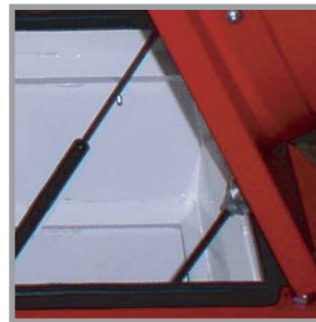
Hinged, tip-up door allows for easy cleaning and accessibility.