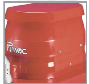
Silencer hood muffles motors for quiet, effective operation.