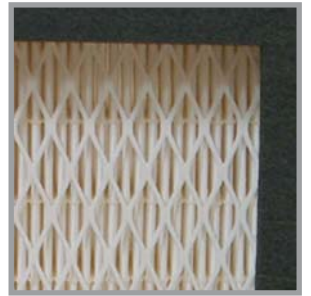
All models are HEPA - ready, should your application require absolute filtration.