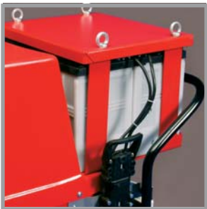
Battery pack features a space-saving design to keep vacuum small and portable.

Specifications are subject to change without notice.