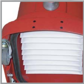
State of the art filtration system cleans effectively and efficiently.