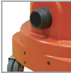
Low inlet inhibits machine from tipping over during use.