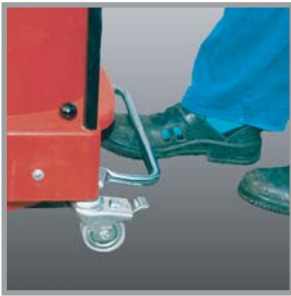
Foot lever actuated drop down dust pan allows for easy waste removal.