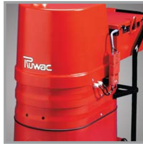
Compression cast composite housing is modular to accommodate additional filters.